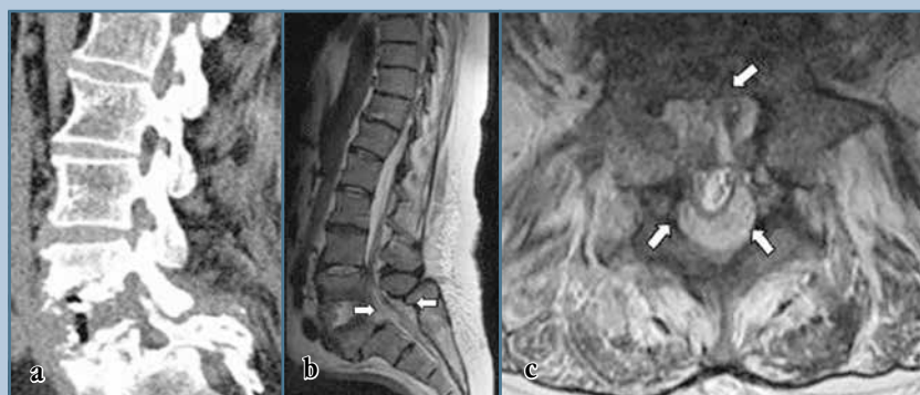
Sagittal CT reconstruction (a) – destruction of the lower end plate of L4 and upper end plate of L5 vertebra; MRI (b, c) – an epidural abscess is visualized

Spindylography (a) – narrowed L4–L5 intervertebral disc height; MRI (b, c) – an epidural abscess is visualized